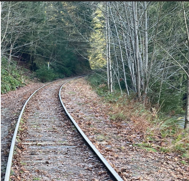
The community, along with our students enjoy safe walking, running and cycling corridors within our community.