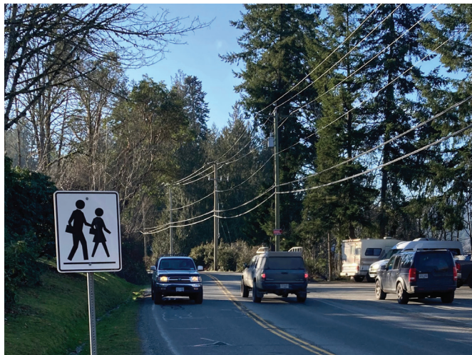
The road situated in front of Saint John's Academy, the stretch of road which vehicles speed on risking pedestrian safety.

Tired of heating your home with expensive fossil fuels like oil, propane or natural gas?