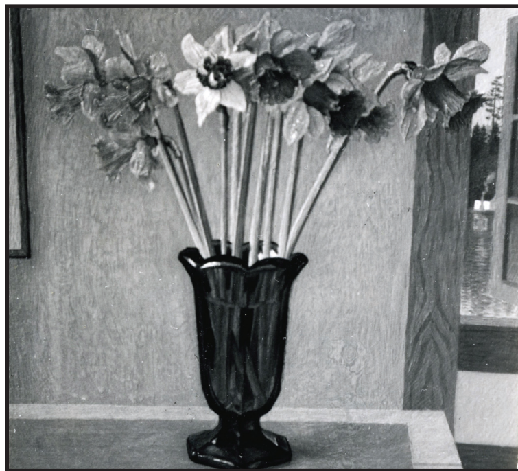
Vase of Daffodils, 1955. Oil on canvas, (20 1/2 x 16 inches).

This praise seemed to have little effect on the artist for the daffodils, the second flower study, was his last.