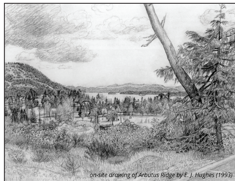
on-site drawing of Arbutus Ridge by E. J. Hughes (1993)

ite sketching sites and to enjoy a meal in one of the many restaurants in the area. In her diary entry for Friday, September 27, 1996 she reports: "I met Ed at Arbutus Ridge at 5:30 on the dot and we had a nice meal. I had the fish soup, a small house salad and chicken fingers, and Ed had a club sandwich and wine."