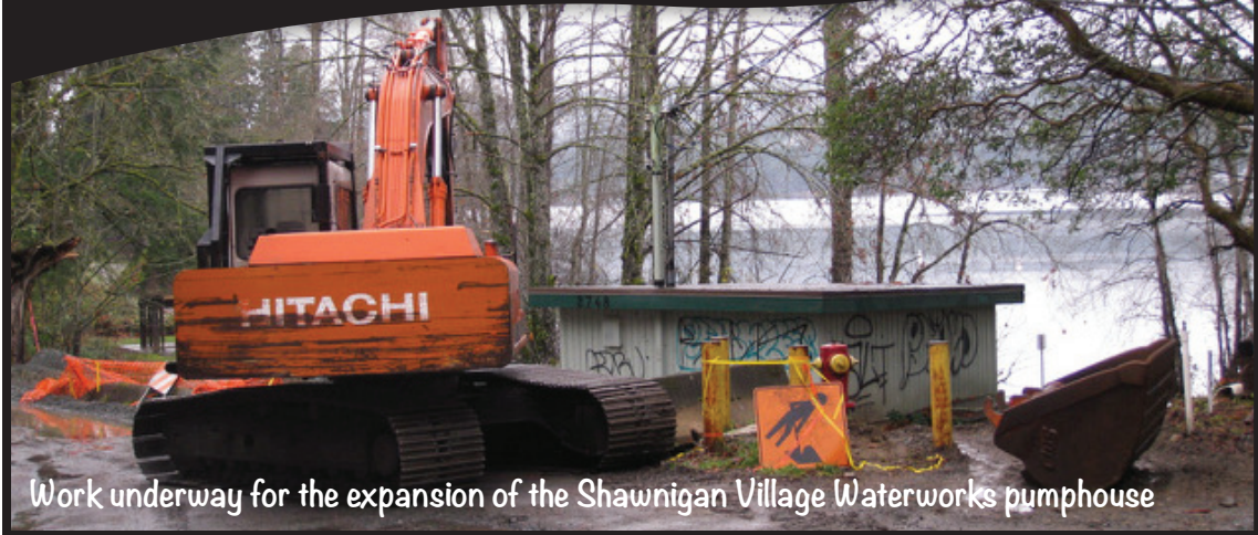
Work underway for the expansion of the Shawnigan Village Waterworks pumphouse