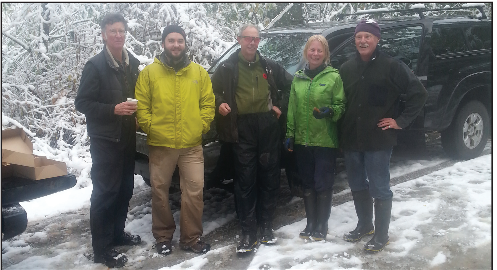
Volunteers braved the elements on November 3, to do additional work on the trails of Old Mt Baldy.